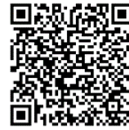
QR Code for Donating VBS Service Project Supplies

Vacation Bible School (VBS) will be happening soon. If you can help provide additional needed supplies by giving a monetary donation and/or by bringing donations to Saint Luke, it will be greatly appreciated. If you will be giving monetarily, go to www.saintlukegive.us and click Vacation Bible School Service Projects or scan the QR code. Needed items include dish soap (18-20 oz.), all-purpose cleaner (approximate 35-35 oz. bottles), boxed cake mix, and frosting. Donations can be placed in the blue bin in the Fireside Room.